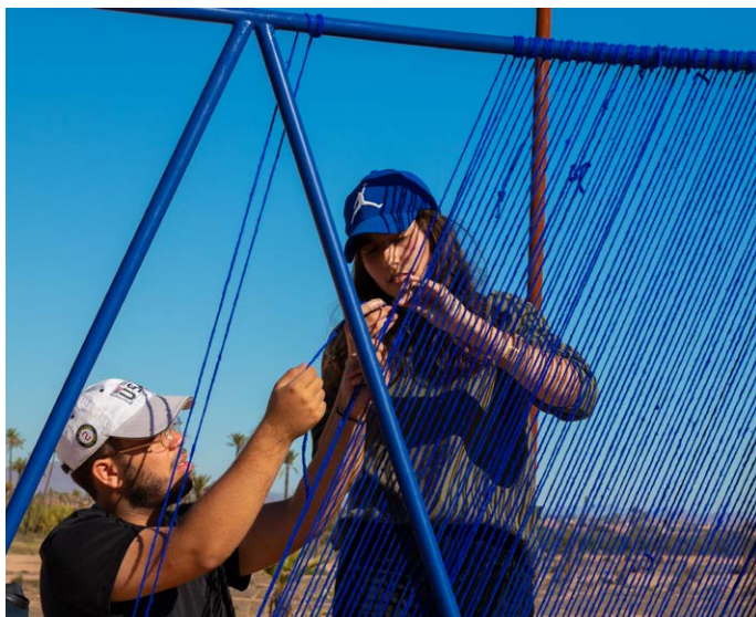
the best ESAM weaving team, Morocco

Main challenges lay in making steps in the right direction for the coming installation in Cairo. As